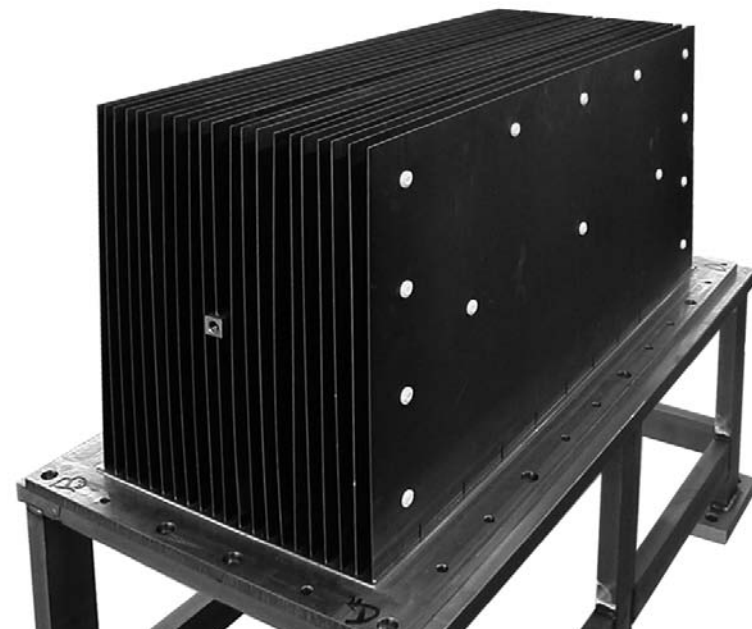
Chlorate Anodic Bundle

De Nora coatings are able to operate at very high current density (up to 6 kA/sq.m.), long life (more than 8 years in many cases) and high efficiency.